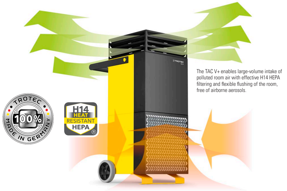
The TAC V+ enables large-volume intake of polluted room air with effective H14 HEPA filtering and flexible flushing of the room, free of airborne aerosols.

By installing several TAC V+, clean air lock areas can be set up as low-aerosol transfer, stay or waiting zones for your customers and employees!