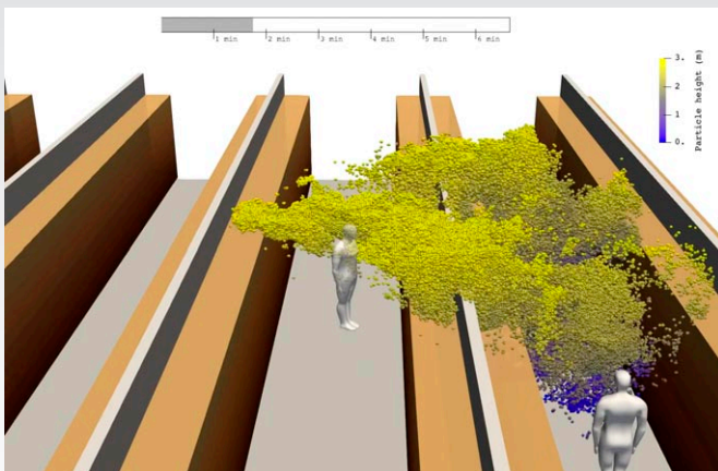
Image quote from a video publication of the research community from Aalto University, the Finnish Meteorological Institute, the Technical Research Center of Finland VTT and the University of Helsinki

A joint Finnish research project led by Aalto University has investigated the transport and spread of the coronavirus by air. The researchers modeled a scenario in which a person coughs in a corridor between shelves, such as that found in grocery stores, taking ventilation into account. Preliminary results suggest that aerosol particles that carry the virus may remain in the air longer than originally thought. In the 3D model, a person coughs in a corridor delimited by shelves under representative indoor air flow conditions. As a result of the cough, an aerosol cloud travels to the corridor in the air. It takes up to several minutes for the cloud to spread and scatter.