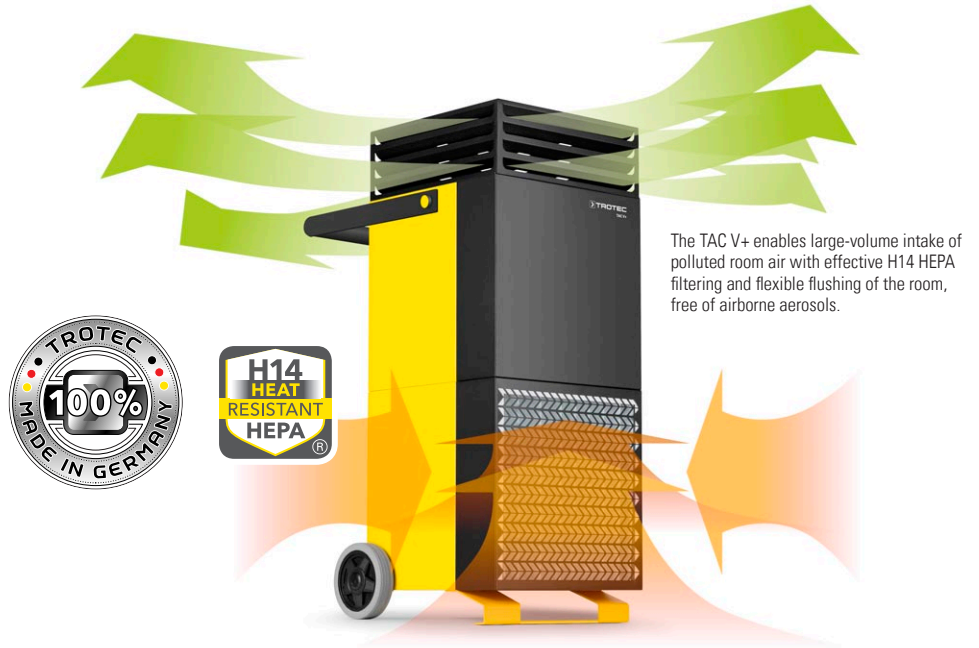
The TAC V+ enables large-volume intake of polluted room air with effective H14 HEPA filtering and flexible flushing of the room, free of airborne aerosols.

By installing several TAC V+, clean air lock areas can be set up as low-aerosol transfer, stay or waiting zones for your customers and employees!